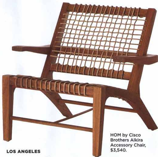
HOM by Cisco Brothers Alkira Accessory Chair, $3,540.