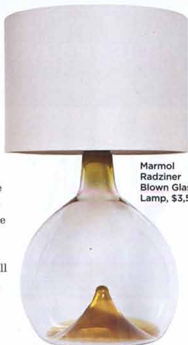
Marmol Radziner Blown Glass Lamp, $3,500.