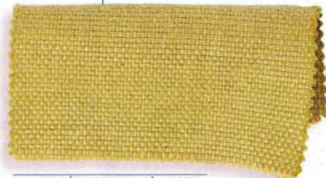
VANESSA (IN PISTACHIO); LINEN

BEST FOR: Small sofa pillows "The exotic pattern, the shimmer, the color—what's not to love?" FORTUNY: 212-753-7153.