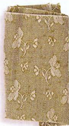
SEMIS MONTRICHARD (IN S100); RAYON, COTTON

BEST FOR: Curtain lining "A detail not everyone sees, but you know it's there!" GEORGE SPENCER THROUGH CLAREMONT: 212-486-1252.