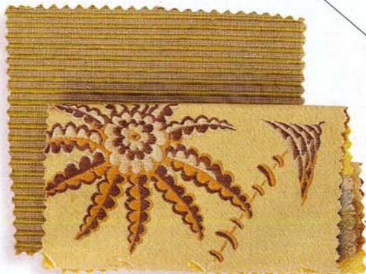
TAYLOR (IN KIWI); COTTON, SILK

BEST FOR: Armchair "Slightly feminine, but not too sweet. A man would feel comfortable sitting in this chair." CLAREMONT: 212-486-1252.