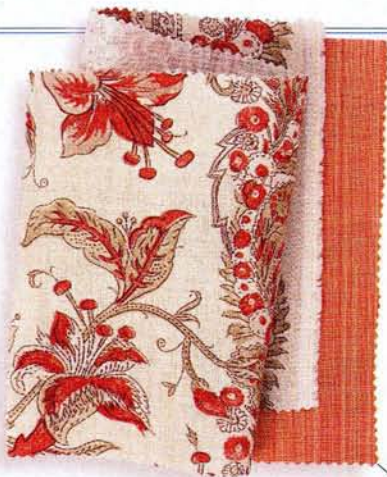
MAHARANI (IN CORAL); LINEN